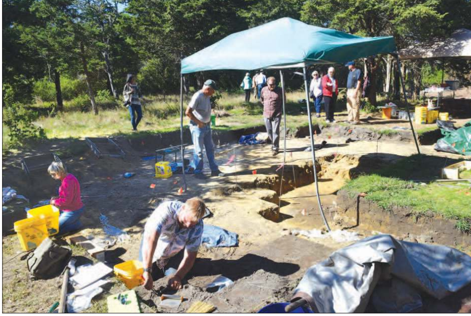
The rare coins were found during archaeological digs at the Nickerson homestead site over the past two years.

· An English bronze farthing is further evidence of economic activity at the homestead.